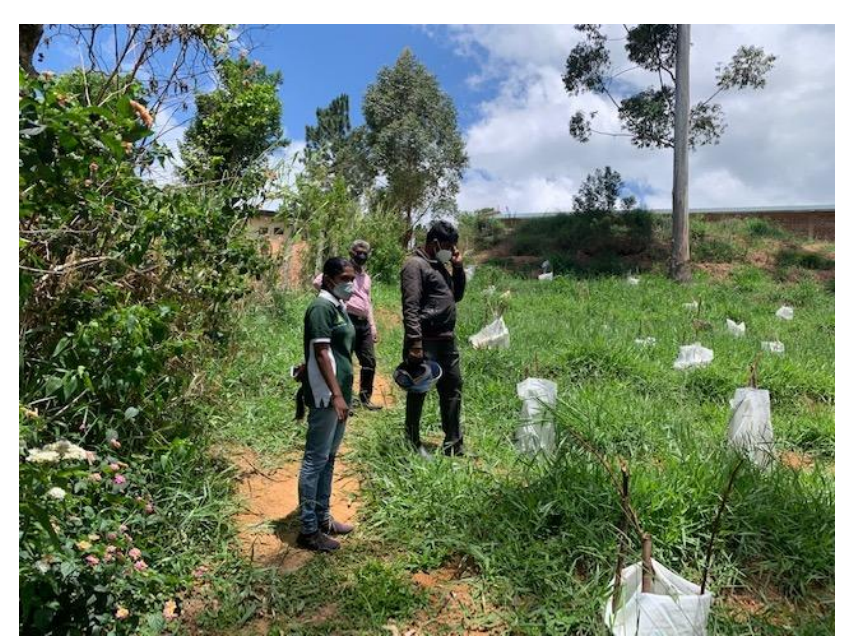
Figure 4: Stakeholder Consultations in Rahangala