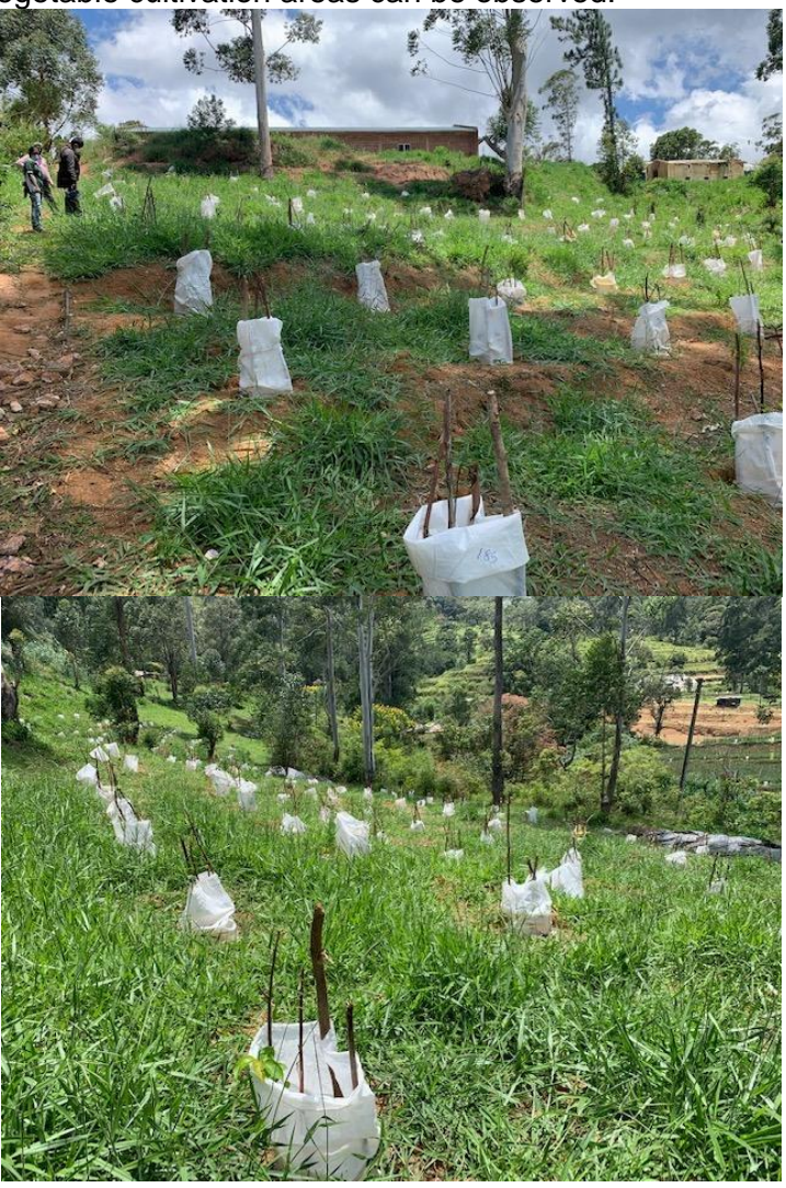
Figure 2: Present condition of the proposed Land

private vegetable cultivation areas can be observed.